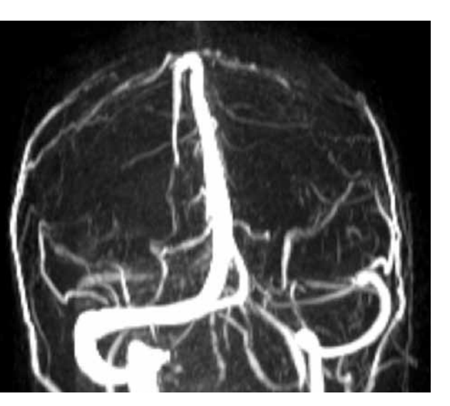
FIG. 2. — The brain MR venography shows hypoplasia of transverse sinus.

HB should not be confused with focal motor seizure, which has a rhythmic, episodic quality and tends to be more localized (2). Since characteristics of abnormal movement of our case are irregular,